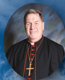
Pilgrimage led by Cardinal Joseph W. Tobin, C.Ss.R.