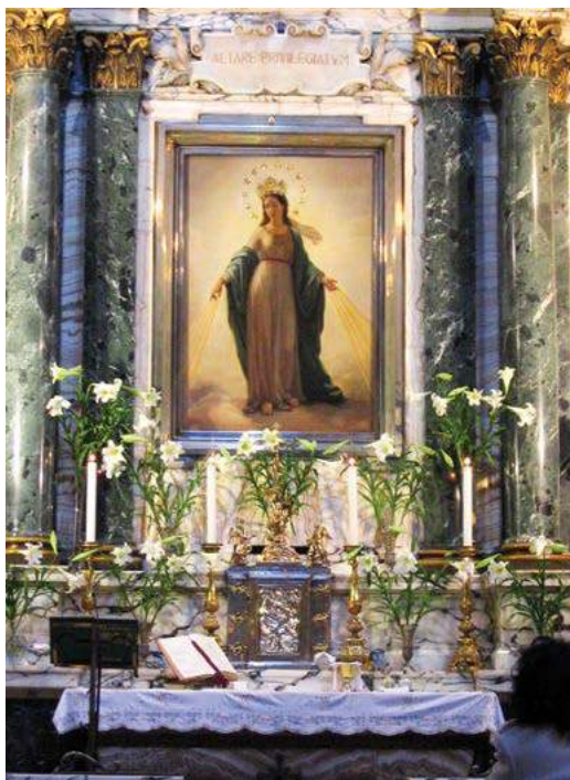
Altar in the church of Sant' Andrea in Rome