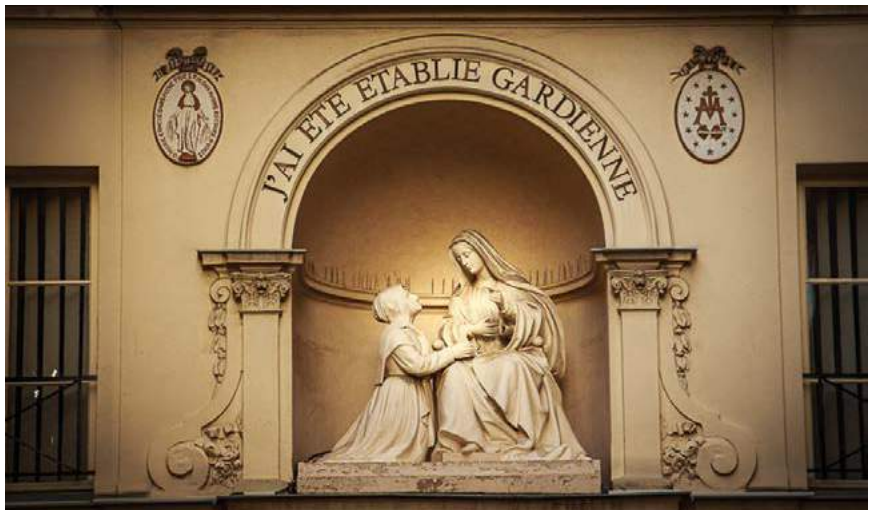
Statue under gate to the chapel at Rue de Bac 140 in Paris

She terminates her account in these words: „To tell you what I understood at the moment the Blessed Virgin offered the globe to Our Lord, would be impossible, or what my feelings were whilst gazing on her! A voice in the depths of my heart said to me: ‘These rays are symbolic of the graces the Blessed Virgin obtains for those who ask for them’.” These few lines, according to her, should be inscribed