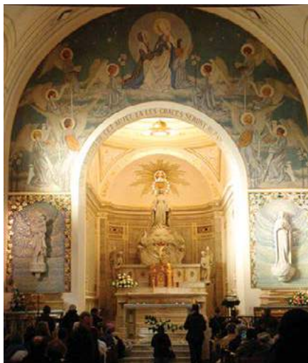
The chapel at Rue de Bac 140 in Paris